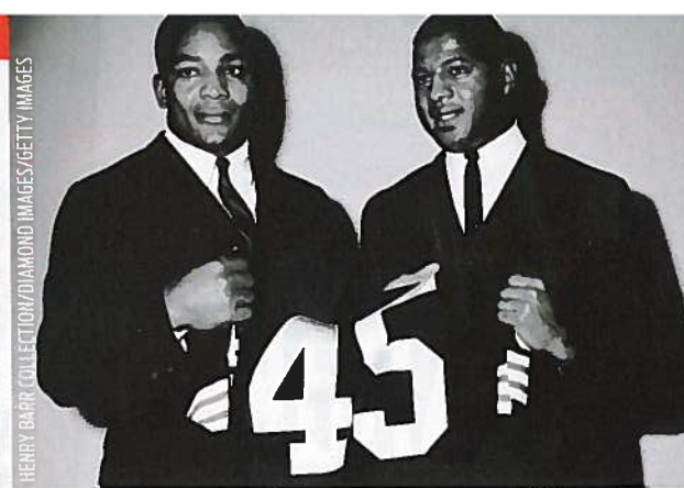
Jim Brown (left) poses with fellow Syracuse backfield alum Ernie Davis shortly after Davis was traded to the Cleveland Browns in 1962.

The 1956 team featured arguably one of the greatest running backs in college