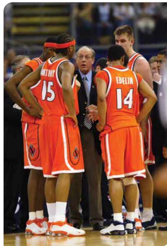
▲ Syracuse head coach Jim Boeheim has led Syracuse to 5 Big East Tournament titles. He trails only Duke's Mike Krzyzewski for the most wins all-time in NCAA history.

games of the tournament. Syracuse jumped out to an early 19-7 lead and carried the momentum into halftime up 37-27. The Tigers scurried into the locker room with no answer for the 'Cuse zone, but came out in the second half showing their teeth and roared to within 1 point with 6:51 left.